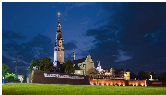
The Jasna Góra Monastery, revered holy site in Częstochowa.

solidified, with the crowning of Mary as ‘Queen of Poland’ through an official Act of Parliament proposed by King John Casimir.”